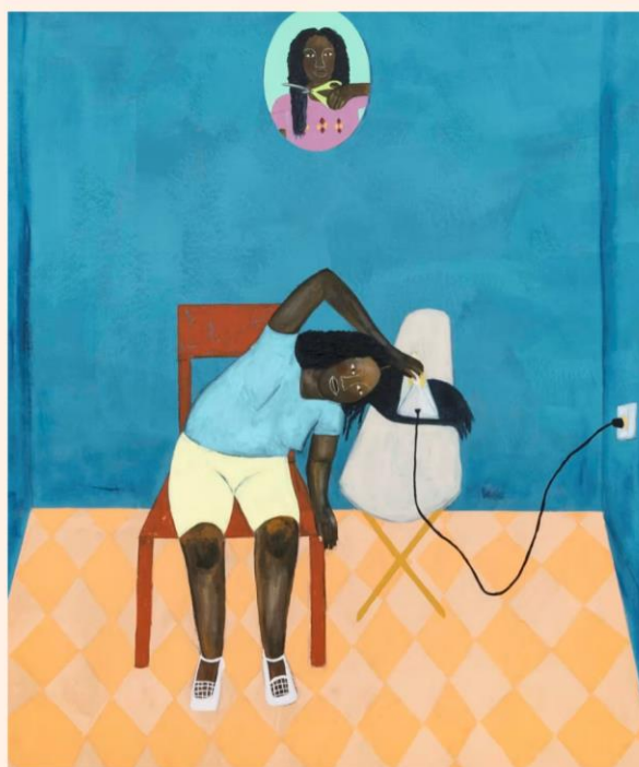
'Não ser eu, para ser aceita' (2022) by Larissa de Souza at Albertz Benda © Courtesy artist/gallery