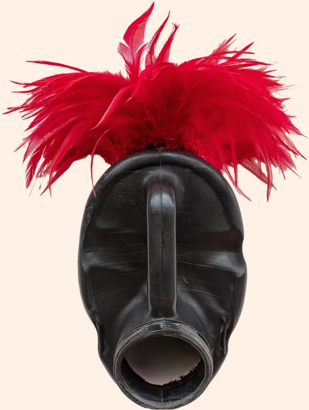
'Afriquoi' (2022) by Romuald Hazoumè at October Gallery © Courtesy artist/gallery. Photo: Romuald Hazoumè

“When we started, there was no established international platform for contemporary African artists”, says El Glaoui. “New artists see 1-54 as an opportunity to enter the world stage, which was not the same for the older generation at the fair . . . In 10-25 years from now, this will be an important visual point in time, when we had an invasion of black portraiture on the market.”